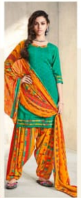
D // 3004