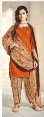
D // 3005