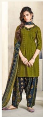
D // 3006