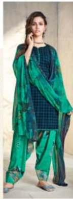
D // 3002