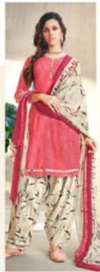
D // 3003