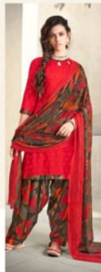
D // 3007