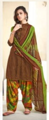
D // 3008