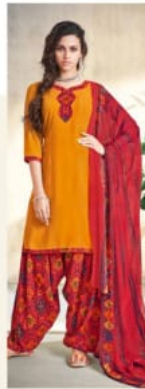
D // 3001